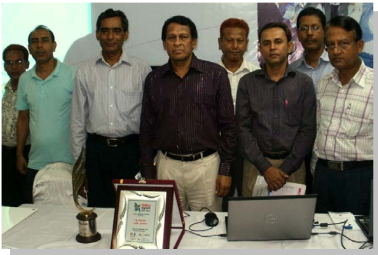
The DGFP team with their awards from the Digital Innovation Fair.

To ensure that patients receive the medicines and commodities they need, when they need them, the pharmaceutical supply chain needs to be both efficient and effective. The SCIP strengthens the supply chain by making web-based tools available to the Bangladesh DGFP and registered public users. For example, the Logistics Management Information System and Stock Status Report provide information on the availability of government-owned contraceptives and raises an alert regarding possible shortages or overages.